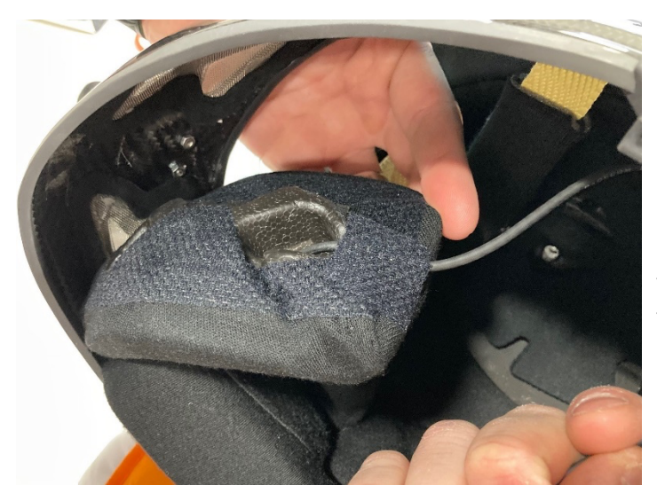
6) Install a cheek pad, then the chin pad followed by the remaining cheek pad. Don't forget the chin straps!

5) In the same manner as in step 4 and 4.1, carefully install the earbud clip on the same side as your microphone and move into place wherever is most comfortable for the driver.