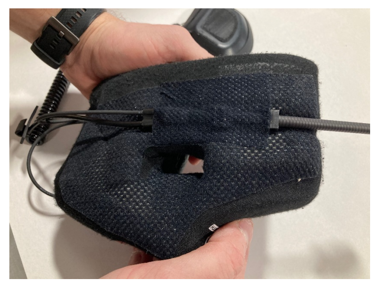
5.2) Place the included strip of nomex tape over top of the microphone boom to help hold it and place all of the equipment into the helmet for step 6.