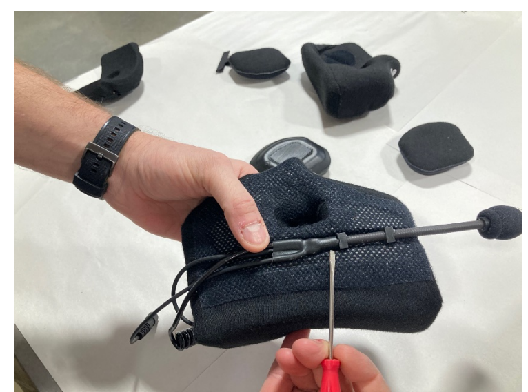
5.1) Place the mic into the cheekpad tray while keeping in mind the "TALK" orientation on the microphone. The edge of the last stem block should be in line with the edge of the chin strap outlet.