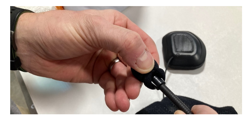
5) Locate the word "TALK" on the Mic Boom. This is the side that will be facing the user. This orientation is important to get correct.