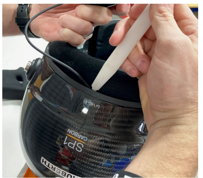
8) Secure the speaker wire in around the back of the helmet by tucking it in with a blunt tool as shown.