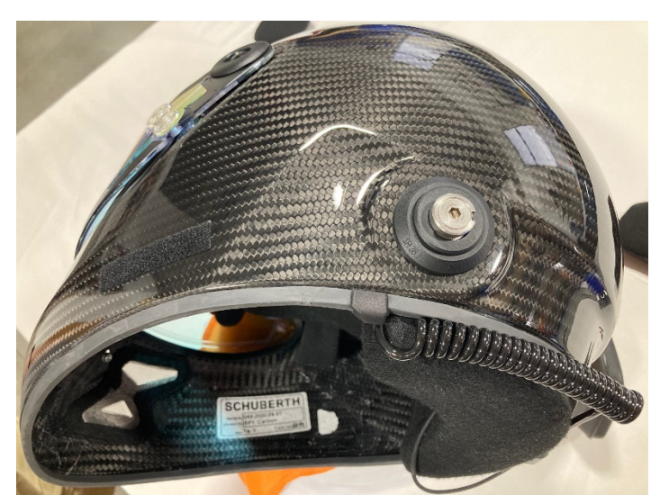
6.1) Carefully work the clip into place as shown. It needs to be as far back against the main EPS as possible.