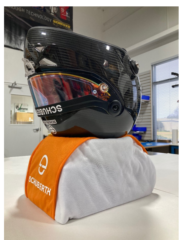
1) Secure helmet to prevent damage and ensure ease of installation