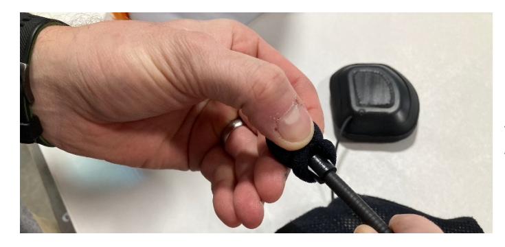
3) Locate the word "TALK" on the Mic Boom.This is the side that will be facing the user.This orientation is important to get correct.