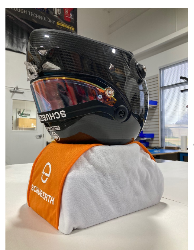
1) Secure helmet to prevent damage and ensure ease of installation