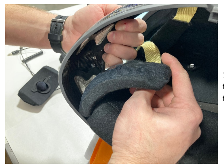
10) Install a cheek pad, then the chin pad followed by the remaining cheek pad. Don't forget the chin straps!