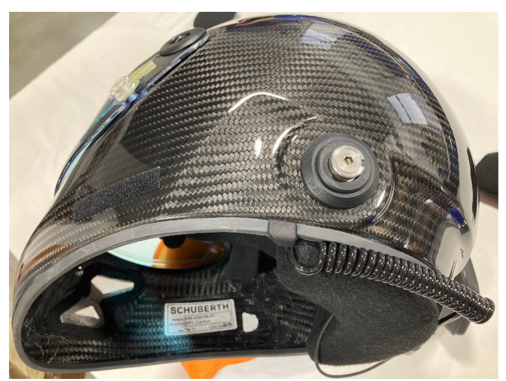
4.1) Carefully work the clip into place as shown. It needs to be as far back against the main EPS as possible.