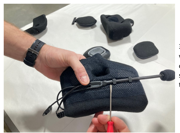
3.1) Place the mic into the cheek pad tray while keeping in mind the "TALK" orientation on the microphone. The edge of the last stem block should be in line with the edge of the chin strap outlet.