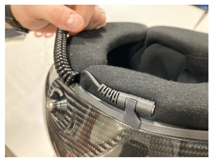
11) Drop the earbud connector into the clip as shown and you're ready to go.

10) Install remaining earcup into the helmet.