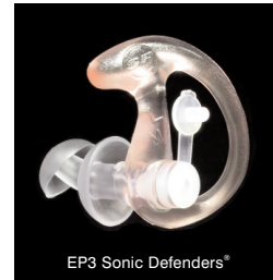
EP3 Sonic Defenders®

The Sonic Defenders have a NRR (noise reduction rating) of 16dB for the 2 flange EP3 earplugs. EP4 Sonic Defenders Plus have 3 flanges and a 19dB NRR 1 . Normal communications can be heard through the filter in both quiet and continuous noise. Localization is good; the device is comfortable, and low profile to fit under hats or helmets.