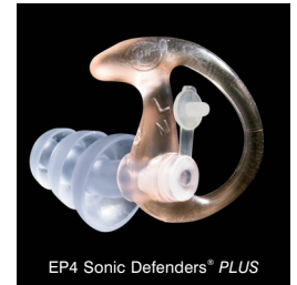
EP4 Sonic Defenders® PLUS

These patent pending earpieces by EarPro by SureFire are made from flexible, hypo-allergenic material that is shaped like the concha of the ear. The flanges are slightly bent to fit the bend of the auditory canal and are very comfortable.